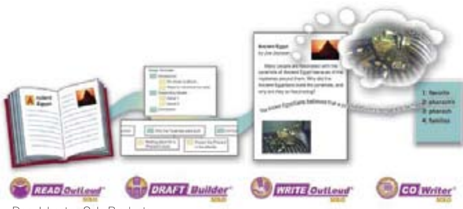
Don Johnston Solo Products

students have pasted the text into the document, they can also save it to go back to and listen at any time. This tool has been used successfully with students who need support when independently editing and revising their work. Students can listen to their written products for word and punctuation omissions and listen to the structure and content of the sentences.